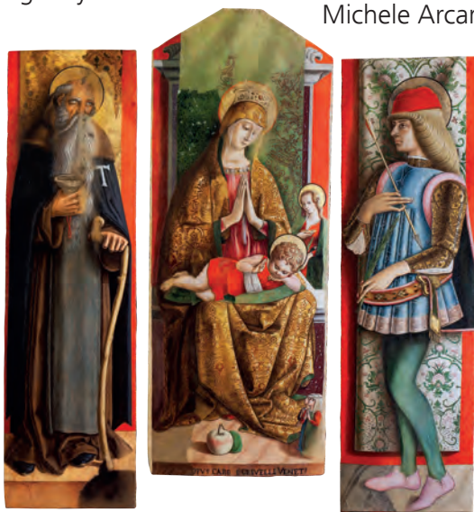
Carlo Crivelli , Second Triptych of Valle Castellana, Virgin Mary and child enthroned between Saints Sebastian and Anthony Abbot

The first section, dedicated to medieval works, features grand wooden crucifixes, including a remarkable example with relief on a shaped cross and a starry blue sky, created for the early Christian church of the Most Holy Saviour in Ancona (now Santi Pellegrino e Teresa, following 18th-century renovations). This 13th-century crucifix belongs to the Christ Triumphant ( Christus Triumphans ) type, similar to the one from Matelica, which is also on display.